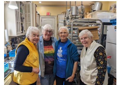
UTC Hope House