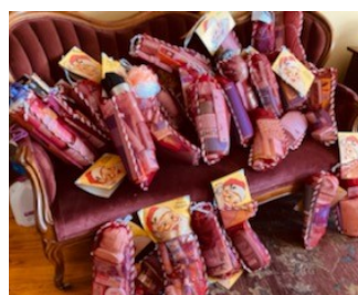
Salvation Army Christmas Stockings