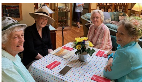
2023 PW Summer Salad