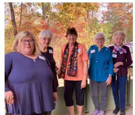
PW 2023 Gathering