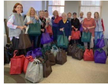
Santa for Seniors Bags