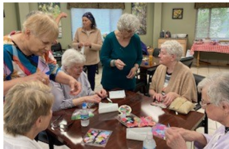
John Calvin Apts Craft Activity