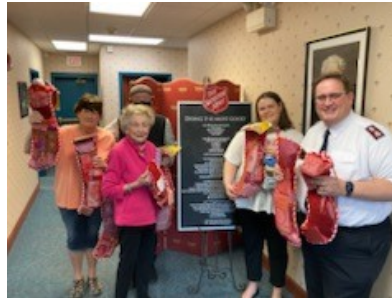
Salvation Army Christmas Stockings