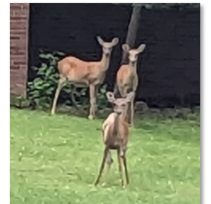
Beautiful Greeters at Moccasin Bend!