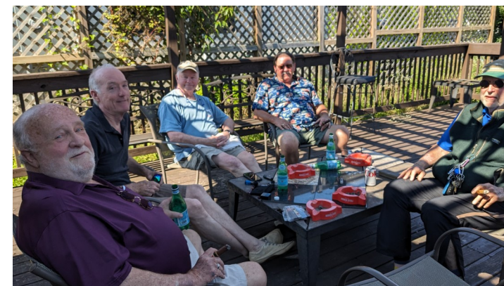
Dangerous Guys! Cigar Group