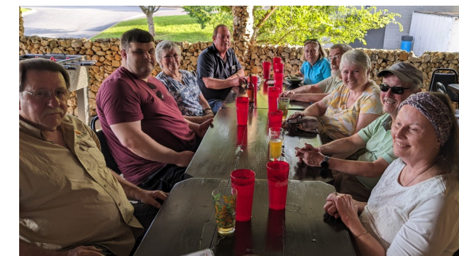
Second Pres Dining Out! Crust Pizza