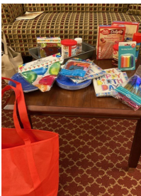
Birthday Bags prepared by PW for the Salvation Army.